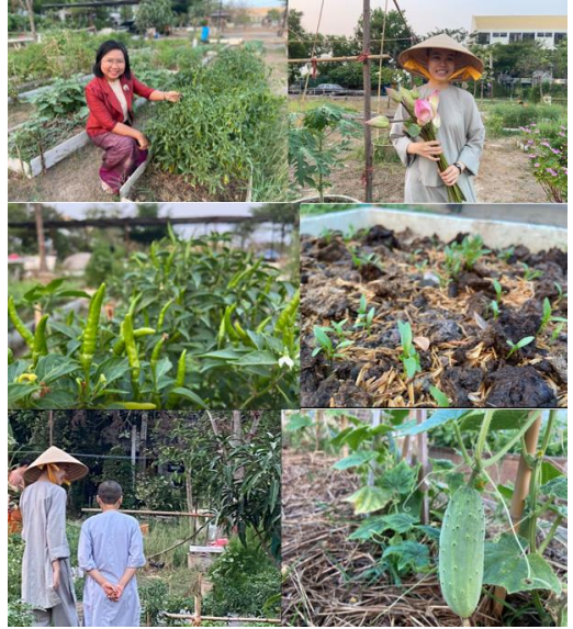
Figure 4 Vegetables garden at the student dormitory building in MCU about 0.5 Heqter for research and model of sustenance food production under to concept of "Balance" (4 April 2020)

Model of vegetable garden in front of the student dormitory building within Mahachulalongkornrajavidyalaya University has shown best practice model based on sustenance food production creating food sources under the COVID-19 situation. The number of students in the dormitory is approximately 200 students, and the university has at least 300-500 numbers of students who are international students from Burma, Laos, Vietnam, Cambodia, China, Sri Lanka, Bangladesh, or other countries cannot return to Thailand under the lockdown situation to prevent the spread of the CORONA virus. The life of the university is like a safe area of living under difficult circumstances and normal life cannot be carried out, but the garden of Buddhist agriculture under the concept of sufficiency economy still running food production and moving for sustenance. Therefore, the concept of food source production at Buddhist University is a mechanism and one model of creating a balance that appears in Buddhist University at Phra Nakhon Si Ayutthaya province as well.