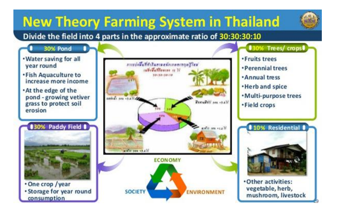
Figure 1 New Theory Farming Systems in Thailand