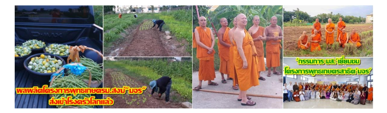
Figure 2 Growing non-toxic vegetables to reduce costs, with the goal of not less than 500-1000 university students who come to study at the university in early 2019 (Photo: Online 29 January 2019).

The figure showed that the vegetable garden in the university was cultivated for study and increasing ways to produce food for the university kitchen with the idea of Buddhist agriculture for the cultivation of non-toxic vegetables for sustenance. The university has many students and some live in the university dormitory and some live at the temples, but circulated into the university as part of their lifestyle. Most students who are foreign students stay at the student dormitory and have to receive food at my university dining hall. The vegetable plots in this section meet the needs which are fundamental factors in food for sustenance for lecturers, administrators and students who living at the university dormitory.