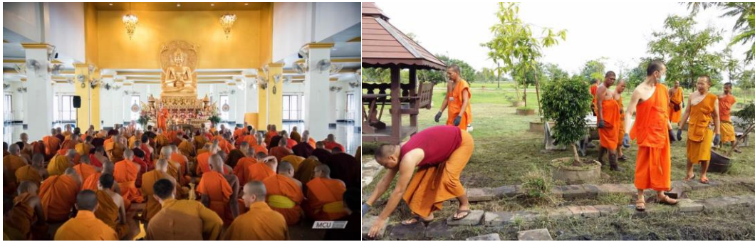
Figure 9 Students join together to do Buddhist ceremony and practice including help each other to clean and look after the area of their loving within the university.

Therefore, when processed in the overview of classroom activities interaction activities between groups in coexistence which the course operates or design universities, all with the goal of coexistence among students. This results in advantages for students to learn together under appropriate guidelines and mechanisms in living between foreign students and Thai students. Foreign students are living together including ethnic groups in the name of Burmese students with historical awareness, ethnic identities in the case of Burma, Tai Yai, Mon, Rakhine, Palaung Pa-O that appear in Thai Buddhist university.