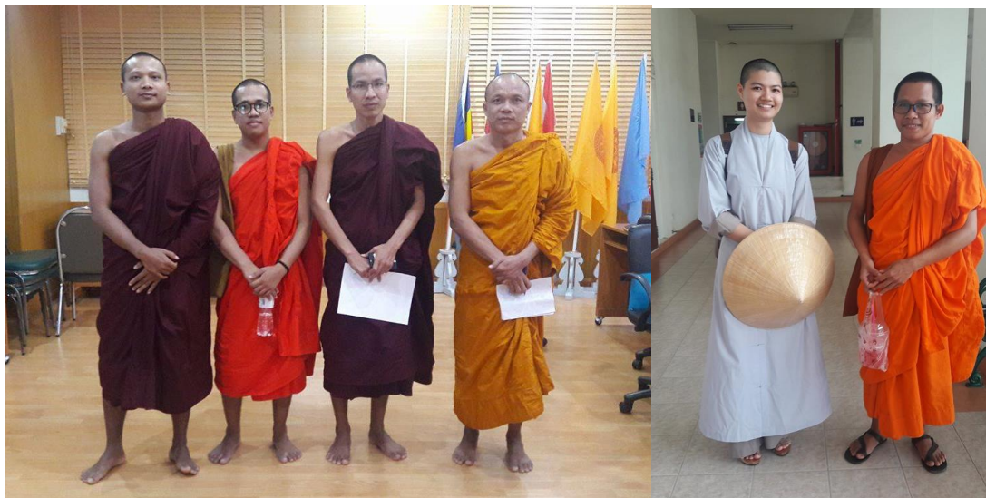
Figure 4 There are 4 monks students from 4 ethnic groups which are Burmar, Rakhine, Pa-O and Kaya from Myanmar. They are also two Vietnamese students who have different Buddhist sects.

The Tai Yai group at the Buddhist University can be divided into 2 groups, which are from Shan State in Myanmar and hold a passport from Myanmar by having knowledge and understanding of Thai language. They studied in 2 courses with experience go in and out and study in Thailand such as from Nan Sangha College, Chiang Mai Campus, Lamphun Campus, Lampang Sangha College, etc. For group 2, they have an immigrant background and a pink card and being a Buddhist monks who studying in Thailand. They study in Thai language course and hold a foreign card which is a hidden population in the Burmese ethnic group. When counting informal statistics, this group of students is up to 200 students and activities are conducted in the form of clubs as well as interacting with other Tai Yai groups that have settled and worked in Thailand (Interview Student B, 26 November 2017)