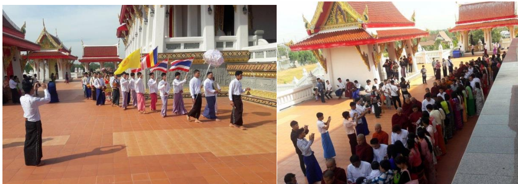
Figure 3 Identity of Buddhist Ceremony of Burmese who work and live in Thailand. They came and joined activities with Burmese at Mahachulalongkornrajavidyalaya University, Year 2017-2018

1. Burmese is the most ethnic group in the country and most of the Burmese live in the Irrawaddy River using Burmese language in their daily lives. Genetically, East Asian and Indian when specific to the Burmese students will wear the robes in the Myanmar style and use Burmese Language as the primary language. There are group activities in the name of Burmese students and it is only in Myanmar group rarely cross-ethnic interaction and can speak in Burmese and English. There is also rarely interaction between other ethnic groups that study in English programs organized by the university such as linguistics or Buddhism in international programs. When counting as a proportion of Burmese students, there will be more than 200 students within Mahachulalongkornrajavidyalaya University, Phra Nakhon Si Ayutthaya Province. There are also joining in group to do activities in the name of the Myanmar Student Club and interacting with Burmese workers who come to work in Thailand through religious ceremonies such as Kathin or Bunpa Pa, etc. (Interview Students A, 24 November 2017)