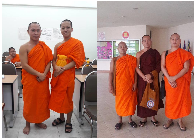
Figure 5 Burmese students live, study and do activities during studying at Buddhist University

The differences of ethnic language and cultural have become important reasons for these students to have no different important characteristics. Due to the fact that those differences create different propulsion processes and identity mechanisms and can make us see that students actually appearing on a variety of ethnicities make a great difference among these students until now. It creates an overall drive towards what is happening under the mechanism of differences and alienation as seen by some students that behave differently from all Thai monks. These values, behaviors, beliefs, and ideas are markedly different.