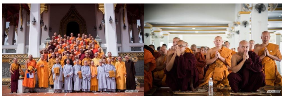
Figure 7 Students attended the activities related to Buddhist Ceremony

2. Living together of a student in the dormitory, for the foreign students will have 2 groups which are in temples in Bangkok or nearby in a dormitory provided by the university. Burmese students who can speak Thai will be at the temple in the area around Mahachulalongkornrajavidyalaya University or temples in which that monk can communicate with each other. However, in the case that cannot speak Thai at all, most of them are at the dormitory for the reason that they cannot communicate with the abbot in Thai temples and most of them can speak Thai as well (Interview Executive B, 27 December 2017) during staying in a dormitory. Therefore, there are activities due to living together such as praying, chanting, residential development, cleaning the place. For example, there will be a cleaning day to clean the accommodation, joint housing development every week that resulting in communication and joint activities which cause a positive interaction between students inside the university dormitory.