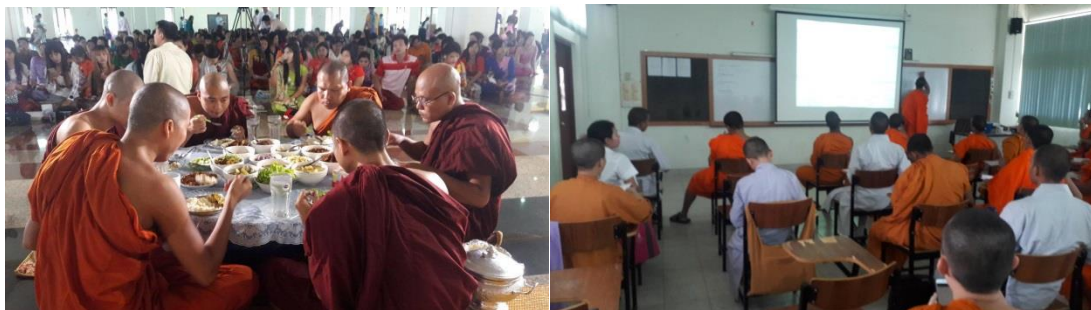
Figure 8 Students activities during they lived together within the university area that caused them learn from other differences.

3. Eating in the university cafeteria, all students, both Thai and foreign students, will live and stay in the dormitory together for a total of more than 1 thousand lives together. Resulting in interaction through eating can make students to communicate from one day to one month, from the month to cause communication, learning and adaptation in a culture of sharing food. In particular, in the case of Burmese students, in the group of Burma, Tai Yai, Mon, Rakhine, most of them still socialize in groups, which mean to eat in the same group. However, there are sometimes moving across the group because of a sense of friendship by living in the same dormitory or near each other. These interactions are positive communication that leads to learning and adaptation under the consciousness of ethnicities as well (Interview Executive C, 24 December 2017).