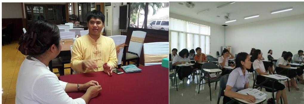
Figure 10 Interview Lecturer from Bhodhivichalaya Srinakharinwirot University, Mae Sot District in Tak Province, on 12 th October 2017

the knowledge of learning through the form of an article for being knowledgeable cross universities including learning experiences that are not directly from the student's knowledge because the case study in each area will have a framework or different learning contexts. Resulting of comparisons to new knowledge and experiences from the case study was acquiring knowledge about ethnicity and diversity. Therefore, it leads to the transmission process and in the transmission, it creates a mechanism and the driving of knowledge that is coordinated because most of the students are people with experience and background in Burma especially about tribes. When useful information was received by citing case studies, it was seen that it would be very useful for studying Burmese sample groups in Buddhist University. Academic administration for students with different language backgrounds, fundamental beliefs and different language values show how these students should behave and express their beliefs. Therefore, it is transferring experience through learning of sharing story, and it is expected that it is a collaboration of body of knowledge in order to learn together and lead to the development of various forms of knowledge until it was an experience of sharing and providing appropriate educational opportunities under feasibility.