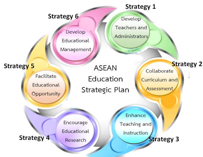
Figure 1. ASEAN Education Strategic Plan

For the strategy of educational management for peace in ASEAN community, it indicated that six strategic aspects were synthesized consisted of strategy 1 develop teachers and administrators, strategy 2 collaborate curriculum and assessment, Strategy 3 enhance teaching and instruction, strategy 4 encourage educational research, strategy 5 facilitate educational opportunity, and strategy 6 develop educational management and showed as below figure.