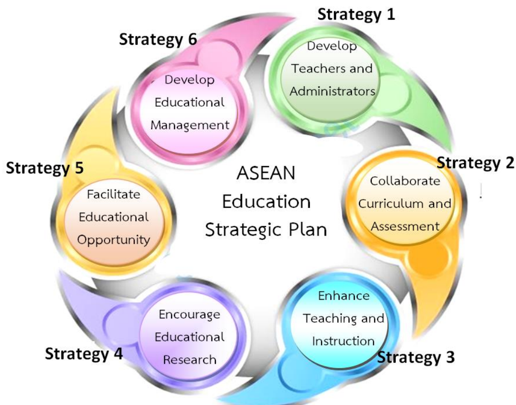
Figure 1 ASEAN Education Strategic Plan