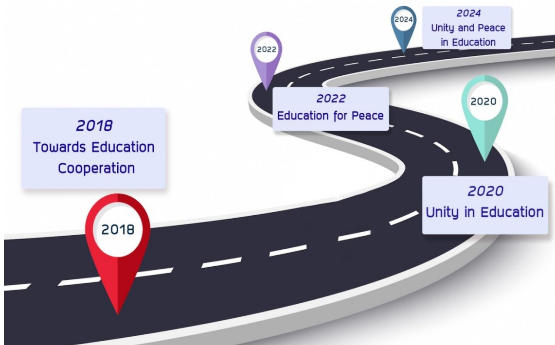
Figure 3 ASEAN Education Roadmap 2018-2024

The scenario was shown in ASEAN education roadmap to predict the future of education that to move towards education cooperation in 2018, to be a unity in education in 2020, to have education for peace in 2022, and to make ASEAN community full of unity and peace of education in 2024 as below figure.